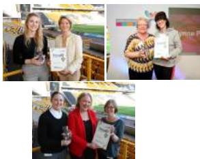
Congratulations to our Winning Schools: Glynne Primary, Bantock Primary and the Federation of Abbey Infant and Abbey Junior Schools.