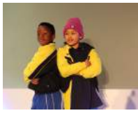
St Jude's Academy Dance Performance opens the conference