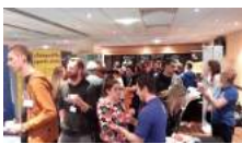
Lunch and another opportunity to visit the exhibitors and network!