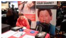
Delegates had an opportunity to network & visit the 16 marketplace exhibitors