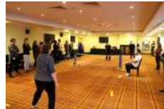
The first workshops got under way!