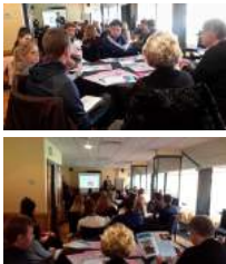
The third and final workshops were underway for the day